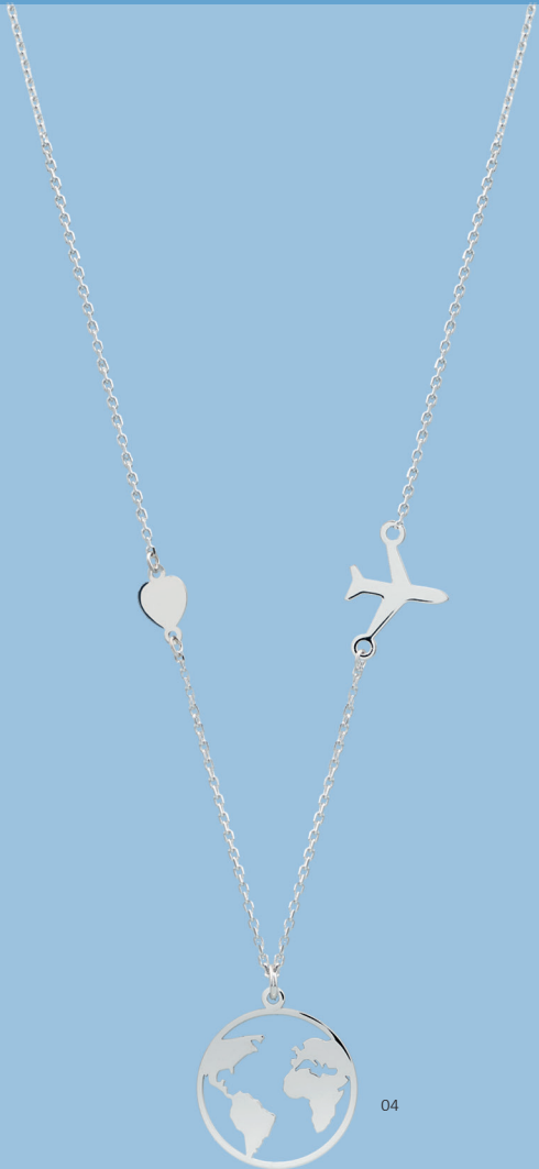
04 | NECKLACE “WORLD” | REF. 2452 925 Sterling silver rhodium-plated necklace with world map (Ø 16mm), heart and plane. Length: 42+2cm