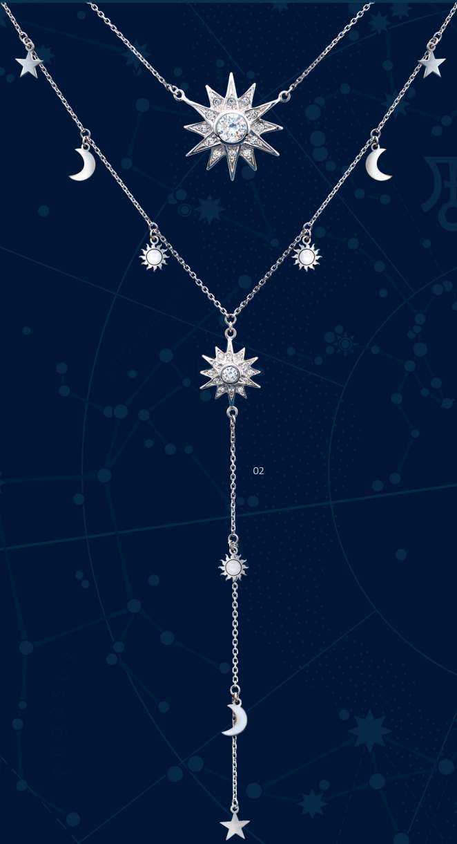
02 | Y-SHAPED NECKLACE “STAR” | REF. 2477 925 Sterling silver rhodium-plated double-stranded necklace with extension (7cm). Two centred stars (Ø 20mm and Ø 10mm) with 26 hand-set white cubic zirconia stones, small star, moon and sun shaped pendants. Length: 37+2cm