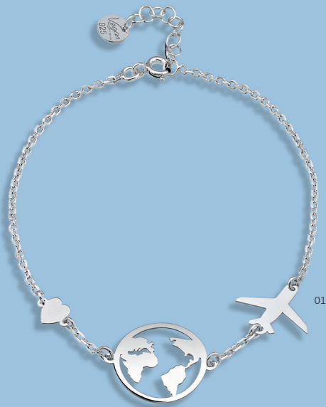
01 | BRACELET “WORLD” | REF. 2453 -1 -2 925 Sterling silver rhodium-plated bracelet with world map (Ø 16mm), heart and plane, 17cm (15+2)-1, 22cm (20+2)-2