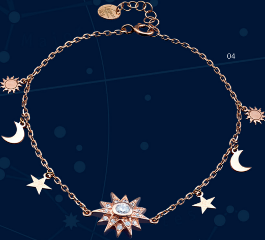
04 | BRACELET “STAR” | REF. 2492 Rose-gold tone plated bracelet in 925 Sterling silver. Stars (Ø 15mm) with 13 hand-set white cubic zirconia stones, small star-shaped pendants. Length: 18+2cm