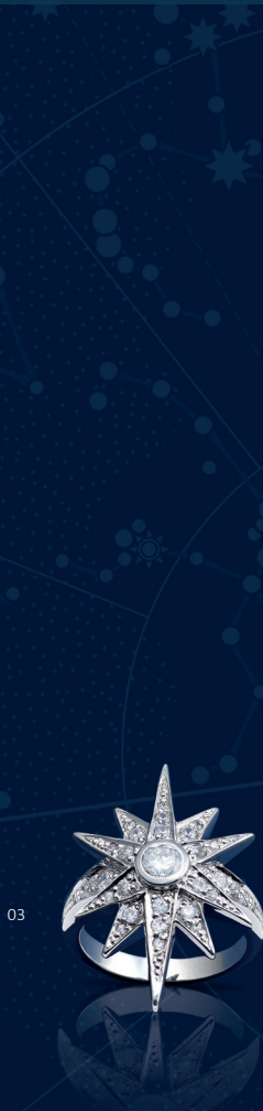
03 | RING “STAR” | REF. 2480 925 Sterling silver rhodium-plated ring. Star (30x20mm) with 31 hand-set white cubic zirconia stones. Size: 50-58*