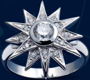
03 | RING “STAR” | REF. 2476 925 Sterling silver rhodium-plated ring. Star (Ø 20mm) with 13 hand-set white cubic zirconia stones. Size: 50-58*