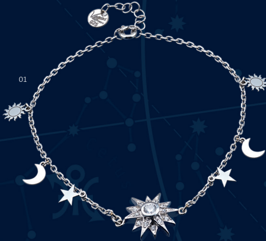
01 | BRACELET “STAR” | REF. 2481 925 Sterling silver rhodium-plated bracelet. Stars (Ø 15mm) with 13 hand-set white cubic zirconia stones, small star-shaped pendants. Length: 18+2cm