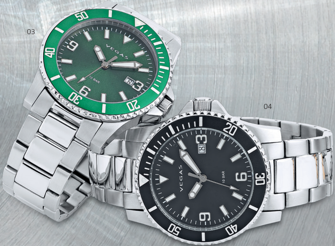
03 | MEN'S WATCH | REF. 2442 Men's watch with green dial (Ø 43mm), case and bracelet in stainless steel, mineral glass, date display, high-quality quartz movement, water resistant 10 ATM