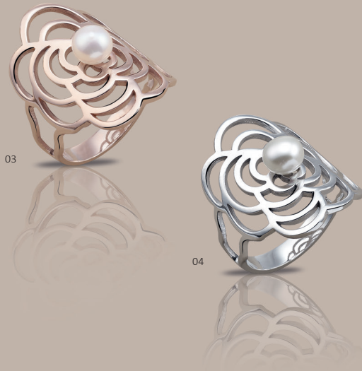
03 | RING “PEARL” | REF. 2467 Rose-gold tone plated ring in 925 Sterling silver with a camellia (25x18mm) and a hand-set white pearl (Ø 6mm). Size: 50-58* 04 | RING “PEARL” | REF. 2466 925 Sterling silver rhodium-plated ring with a camellia (25x18mm) and a hand-set white pearl (Ø 6mm). Size: 50-58*