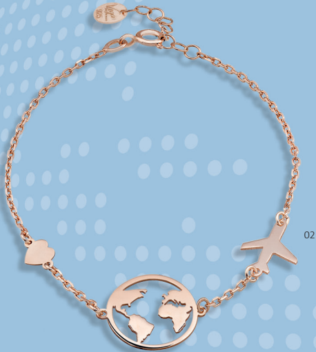
02 | BRACELET “WORLD” | REF. 2456 -1 -2 Rose-gold tone plated bracelet in 925 Sterling silver with world map (Ø 16mm), heart and plane, 17cm (15+2)-1, 22cm (20+2)-2