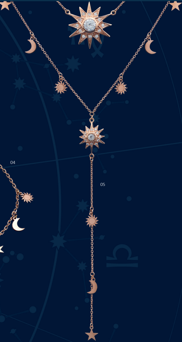
05 | Y-SHAPED NECKLACE “STAR” | REF. 2478 Rose-gold tone plated double-stranded necklace in 925 Sterling silver with extension (7cm). Two centred stars (Ø 20mm and Ø 10mm) with 26 hand-set white cubic zirconia stones, small star, moon and sun shaped pendants. Length: 37+2cm