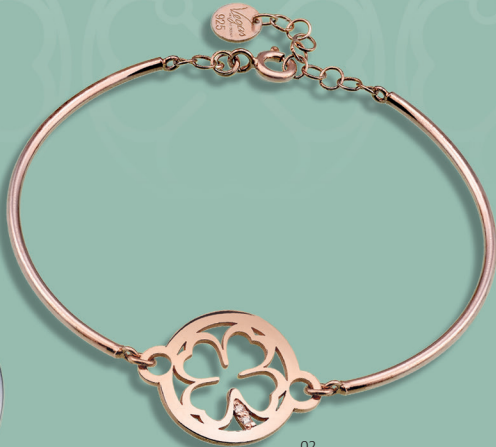
02 | BRACELET “FOUR-LEAF CLOVER” | REF. 2463 Rose-gold tone plated bracelet in 925 Sterling silver with a four-leaf clover pendant (Ø 14mm) and 2 hand-set white cubic zirconia stones. Length: 19cm