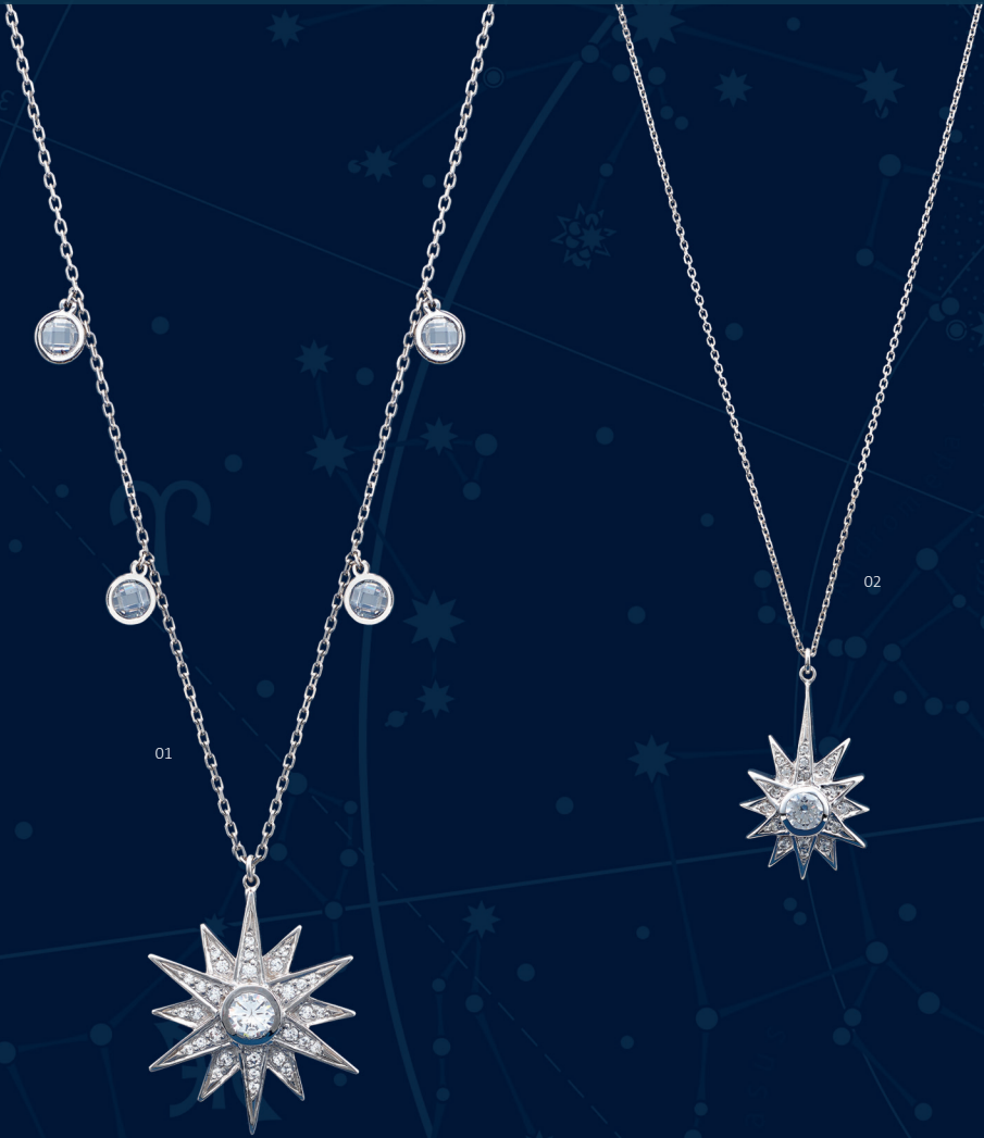
01 | NECKLACE “STAR” | REF. 2474 925 Sterling silver rhodium-plated necklace. Star pendant (30x25mm) with 31 hand-set white cubic zirconia stones and other 4 white cubic zirconia stones on the chain. Length: 70+2cm