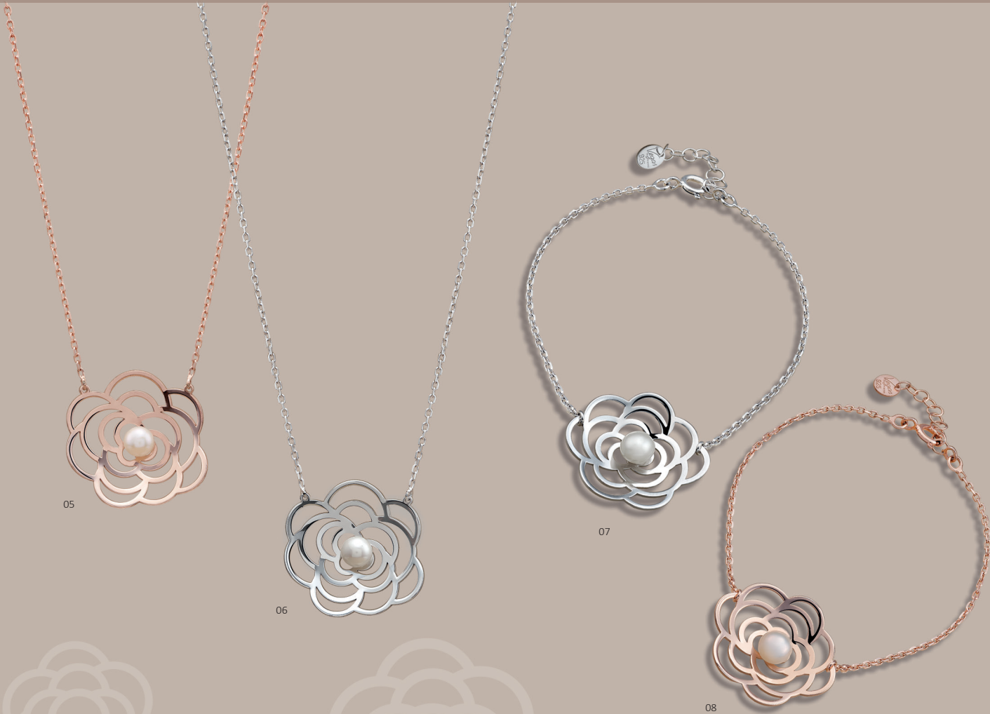
05 | NECKLACE “PEARL” | REF. 2471 Rose-gold tone plated necklace in 925 Sterling silver with a camellia (Ø 26mm) and a hand-set white pearl (Ø 6mm). Length: 40+2cm 06 | NECKLACE “PEARL” | REF. 2470 925 Sterling silver rhodium-plated necklace with a camellia (Ø 26mm) and a hand-set white pearl (Ø 6mm). Length: 40+2cm 07 | BRACELET “PEARL” | REF. 2472 925 Sterling silver rhodium-plated bracelet with a camellia (Ø 22mm) and a hand-set white pearl (Ø 6mm). Length: 17+2cm 08 | BRACELET “PEARL” | REF. 2473 Rose-gold tone plated bracelet in 925 Sterling silver with a camellia (Ø 22mm) and a hand-set white pearl (Ø 6mm). Length: 17+2cm