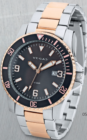
05 | MEN'S WATCH | REF. 2444 Men's watch with black dial (Ø 43mm), bicolour case and bracelet in stainless steel, mineral glass, date display, high-quality quartz movement, water resistant 10 ATM