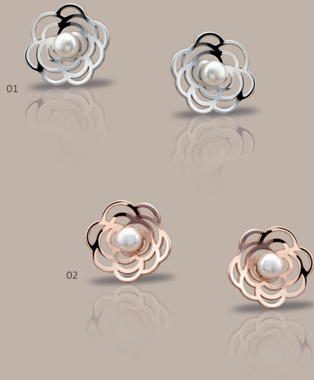
01 | STUD EARRINGS “PEARL” | REF. 2468 925 Sterling silver rhodium-plated stud earrings with a camellia (Ø 15mm) and a hand-set white pearl (Ø 5mm). Clasp: Push Back 02 | STUD EARRINGS “PEARL” | REF. 2469 Rose-gold tone plated stud earrings in 925 Sterling silver with a camellia (Ø 15mm) and a hand-set white pearl (Ø 5mm). Clasp: Push Back