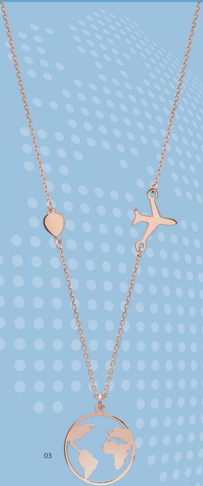
03 | NECKLACE “WORLD” | REF. 2455 Rose-gold tone plated necklace in 925 Sterling silver with world map (Ø 16mm), heart and plane. Length: 42+2cm