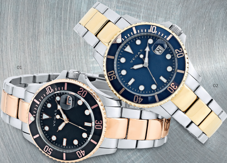
02 | WOMEN'S WATCH | REF. 2446 Women's watch with blue dial (Ø 40mm), bicolour case and bracelet in stainless steel, mineral glass, date display, high-quality quartz movement, water resistant 5 ATM