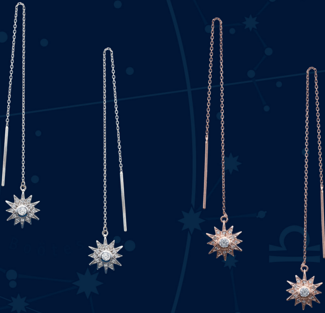
06 | EARRINGS “STAR” | REF. 2482 925 Sterling silver rhodium-plated earrings. Stars (Ø 10mm) with 13 hand-set white cubic zirconia stones. (Dim.: 10+2cm)