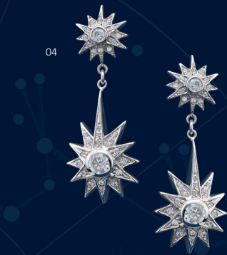
04 | STUD EARRINGS “STAR” | REF. 2479 925 Sterling silver rhodium-plated stud earrings. Two stars (25x15mm and Ø 10mm) with 31 hand-set white cubic zirconia stones. Clasp: Push Back. (Dim.: 4cm)